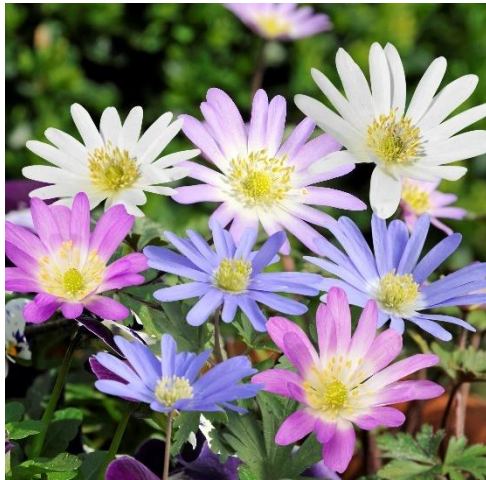
Mixed Anemone Blanda Cost: $4.90 MSRP: $16-$18