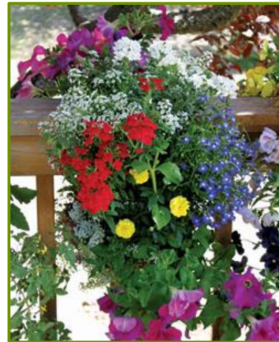
Sun-Loving Cost: $2.80 MSRP: $9-$11