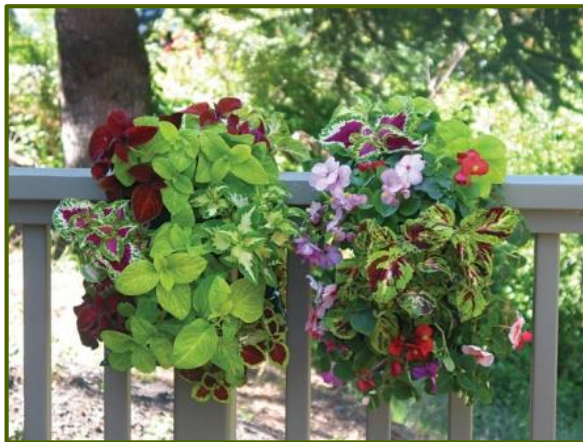
Shade Loving Saddlebag Kits - Mixed Coleus & Shady Annual - Set of 2 Cost: $3.00 MSRP: $10-$12