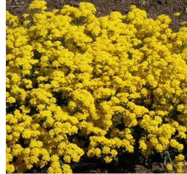
Basket of Gold Alyssum

An easy way to create lots of color, texture and fragrance instead of a green lawn covering. Our lawn solution ground cover gardens are easy to grow and an indispensable part of any well designed garden providing colorful flowers and attractive foliage. These low growing ground cover mats are great for using as an alternative lawn, filling spaces between flagstone and pavers, and cooling the ground and suppressing weed growth.