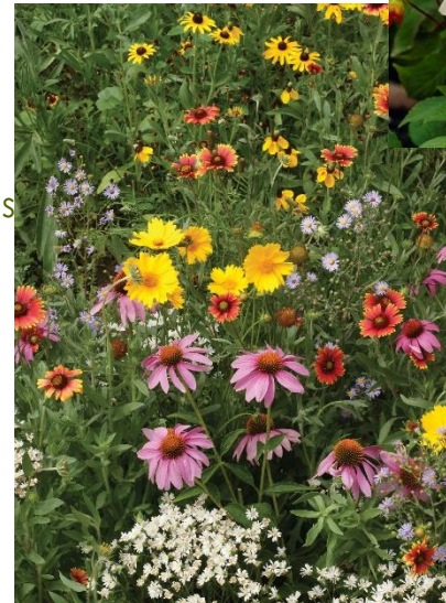
Honeybee Cost: $1.70 MSRP: $6-$8