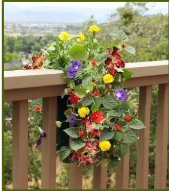
Hummingbird – includes 1 vertical garden with rope and 1 saddlebag Cost: $2.90 MSRP: $10-$12