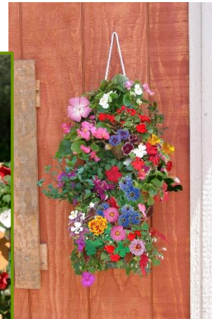
Butterfly– includes 1 vertical garden with rope and 1 saddlebag Cost: $2.90 MSRP: $10-$12