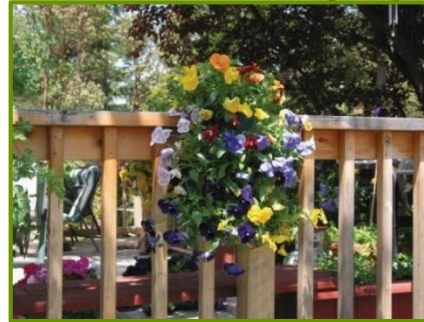
Pansies Cost: $3.30 MSRP: $10-$12