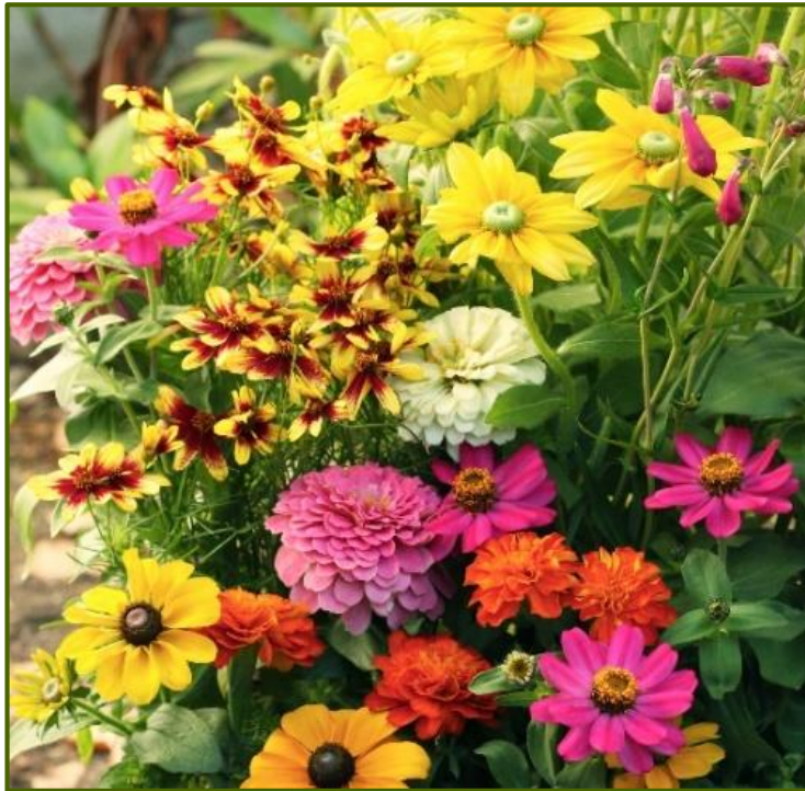
Hummingbird & Butterfly Mix – two 8 foot mats Cost: $2.90 MSRP: $10-$12