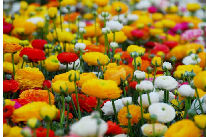
Mixed Persian Buttercups