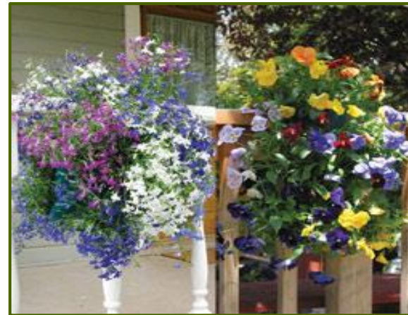
Sun Loving Saddlebag Kits - Mixed Pansy & Lobelia - Set of 2 Cost: $3.00 MSRP: $10-$12