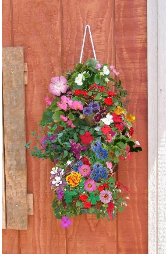
Butterfly Cost: $2.80 MSRP: $9-$11