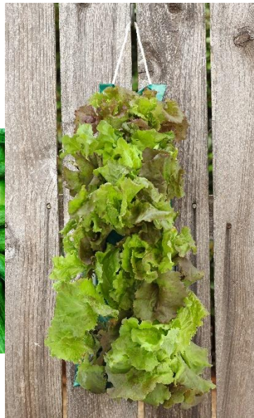
Cucumber & Lettuce Cost: $3.50 MSRP: $13-$15