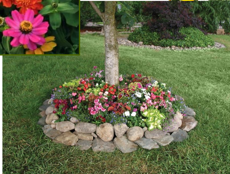
Shady Mix – two 6 foot mats Cost: $2.60 MSRP: $9-$11