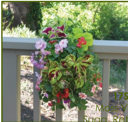
Shade-Loving Cost: $2.80 MSRP: $9-$11