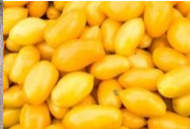
Tomatoes-Cherry & Yellow Pear Cost: $3.40 MSRP: $12-$14