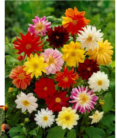
Dwarf Dahlias Cost: $2.00 MSRP: $7-$9