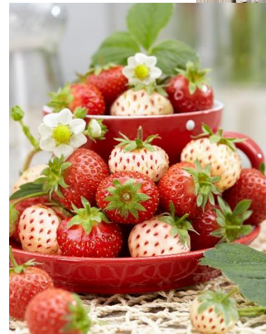
White & Red Strawberries Cost: $3.60 MSRP: $14-$16