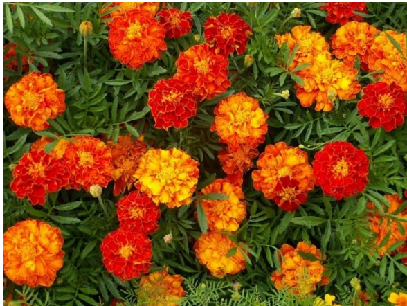
Merry Marigolds Cost: $2.00 MSRP: $7-$9