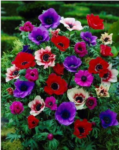
Mixed Anemone De Caen