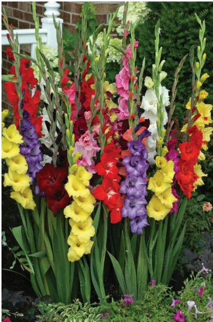
Mixed Gladiolus Cost: $5.40 MSRP: $18-$20