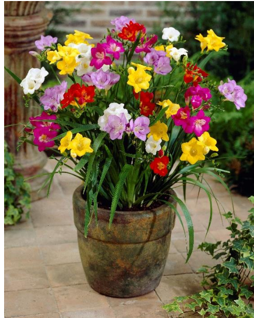
Mixed Freesia Cost: $5.10 MSRP: $17-$19